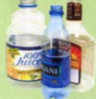
Plastic bottles (necks smaller than base)